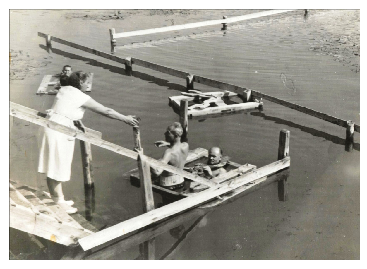
Figure I The first WHT hanger equipment constructed by Moll in 1953. Abbreviation: WHT, weightbath hydrotraction treatment.

As a strict rule, the extra weight loads are always placed below the part to be stretched. The therapist must show caution when placing these weights. The special anatomic characteristics of the patient must be taken into consideration regarding the position and measure of the segment to be treated. For example, to stretch the segment, L5–S1, it is important to avoid placing the weights over the plane of the hips as the treatment will be ineffective.