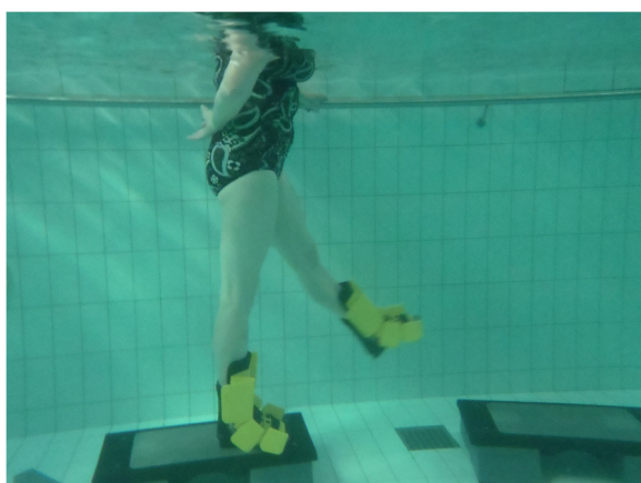
Figure 3 Hip flexion/extension in standing.

Weeks 1-2 is an introductory period to allow subjects to become familiar with the movements with sets of 45 - seconds duration per leg per set with no resistance i.e. barefoot. Weeks 3-5 will consist of alternate trainings of 30 or 45 seconds with small fins (THERABAND PRODUCTS, The Hygienic Corporation, Akron, OH 44310 USA). Weeks 6-8 will be 3 week period with 45 seconds of work alternating sessions with small aquafins and large resistance boots (Hydro-Tone hydro-boots, Hydro-Tone Fitness Systems, Inc. Orange, CA 92865-2760, USA). Weeks 9-11 and 13-16 will consist of alternate trainings with