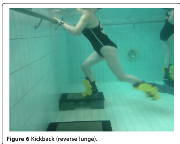
Figure 6 Kickback (reverse lunge).

work of 30 and 45 seconds with large boots. Week 12 will consist of one session barefooted, one with small fins and one with large boots, work duration will be 45 seconds per set. The frontal area of aquafin resistance fins is 0.0181 m 2 and that of the large resistance boots 0.075 m 2 . In a previous study the drag experienced during seated aquatic knee flexion/extension exercises in healthy women was triple with the large boots compared to the barefoot condition. Additionally, a significant increase in EMG activity was seen with the large boots compared to no boots [117,122].