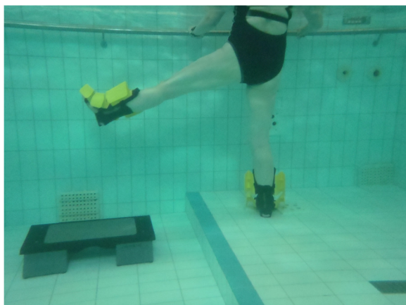
Figure 2 Hip abduction/adduction in standing.