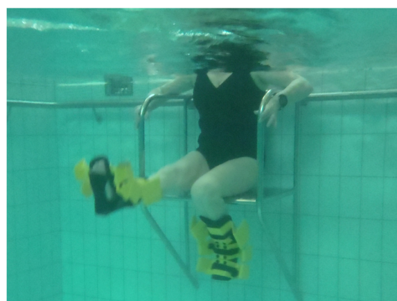
Figure 5 Knee flexion/extension in sitting.