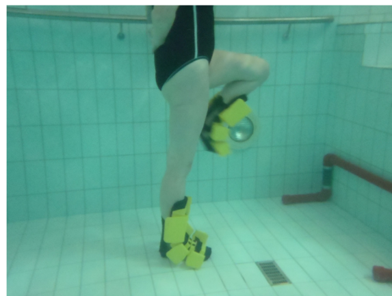
Figure 4 Knee flexion/extension in standing.

every training session immediately after the main set before the cool down. All sessions will be supervised by 2 experienced physiotherapists, who had been trained to instruct these aquatic programmes and accredited for life-saving before the trial began.